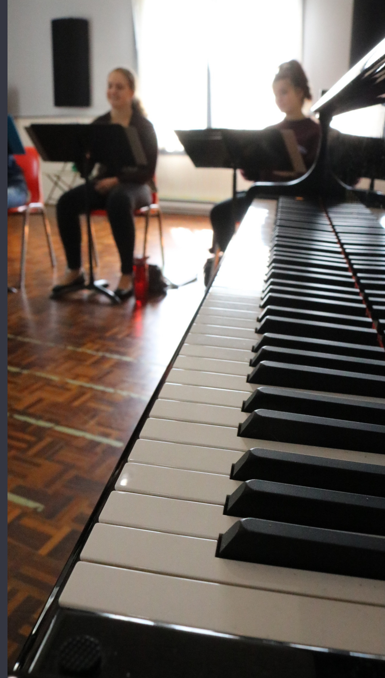
Level 1 - Sat 2-3pm Level 2 - Wed 5:30-6:30pm Level 3 - Mon 6-7pm

The purpose of the DCMS Sight Singing Class is to help musicians develop the tools necessary for music literacy and to translate that into singing. We will be holding classes on Zoom until further notice.